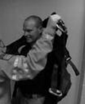
A.R.V. is placed behind casualty's back and laid over casualty's shoulder, with casualty's arms either at their side or placed through the side openings of the

Before lifting, ensure proper placements of A.R.V. with casualty's hand placement correct and proper carabiner loading. Use side adjustment system as required.