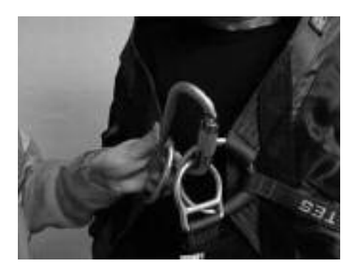
Carabiner is used for direct attachment to hoist hook, short haul line assembly, or other rescue system.

It does not matter the specific order in which you attach the 3