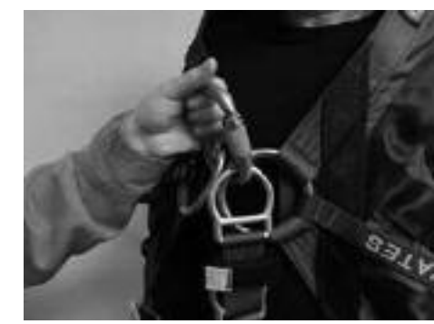
After 3 point attachment, ensure carabiner is loaded correctly.